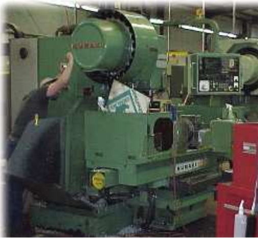
Kuraki 700C Vertical Mill

DTI provides superior precision machining services with our professionally trained staff and over 45 CNC mills. This is achieved with modern CNC machines programmed and operated by experienced and dedicated machinists. With the support of our own in-house Engineering department, our CNC programmers take advantage of the latest CAD/CAM software. This enables us to program your parts to exacting specifications and tolerances.