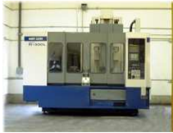
Mori-Seiki M300L CNC vertical mill