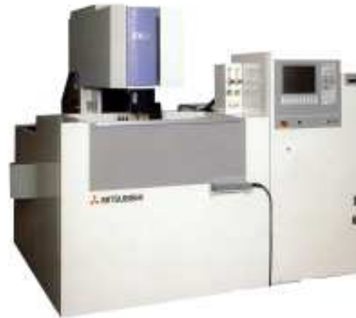
One of two Mitsubishi FX20's used at DTI

The size of the EDM work does not matter to DTI, each job is assigned a program manager to walk you through each and every process step to ensure all your questions and concerns are addressed to your satisfaction.