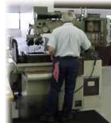
Mitsubishi 90C -CNC Wire EDM